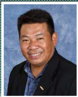
Bishop Gopal Lama National Overseer Nepal

January 2017 | Harvest Partners | Volume 4, Issue 1